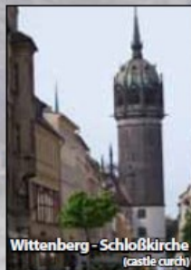
Wittenberg - Schloßkirche (castle church)

The journey will include a stopover at WITTENBERG, the place where Martin Luther worked as a theology professor from 1511 - the main domain of his career, where he started off as a preacher and in 1517 nailed his ninety-five theses on the door of the Castle Church. You will follow the traces of the Reformation on „Luther Path“ which will lead you to Castle Church with Theses Doors, Cranach Court-yard, and Luther's House.