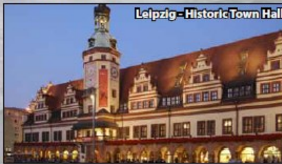
Leipzig - Historic Town Hall