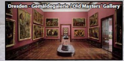
Dresden - Gemäldegalerie / Old Masters' Gallery

The eventful day could be brought to an enjoyable conclusion with a boat trip on River Elbe with Jazz Music and Dinner; for enthusiasts of classical music, the MDR Musiksommer offers a concert.