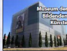
Museum der Bildenden Künste

In the morning, a guided tour of the city will lead you to the most important places of LEIPZIG's history as well as to famous sites of the German revolution of 1849, which earned the city the predicate „City of Heroes“. Our tour will end at Museum der Bildenden Künste, which is renowned for its exhibition of paintings of Neo Rauch and Bernhard Heisig.