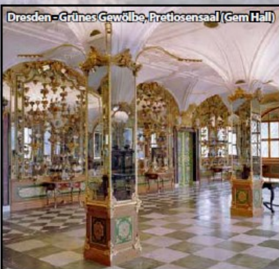
Dresden - Grünes Gewölbe, Pretiosensaal (Gem Hall)