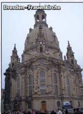
Dresden - Frauenkirche

The most famous symbol of reconstruction in the city centre is the Dresden Frauenkirche, the magnificent baroque dome rebuilt 1992-2005, which dominates the city centre.