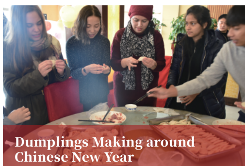
Dumplings Making around Chinese New Year

International Student Office holds extra-curricular activities every year, welcoming all international and domestic students to join for wonderful cultural experiences. Students gain knowledge, friendship, and deeper understanding of each other from the activities.