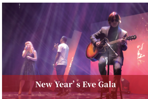
New Year's Eve Gala