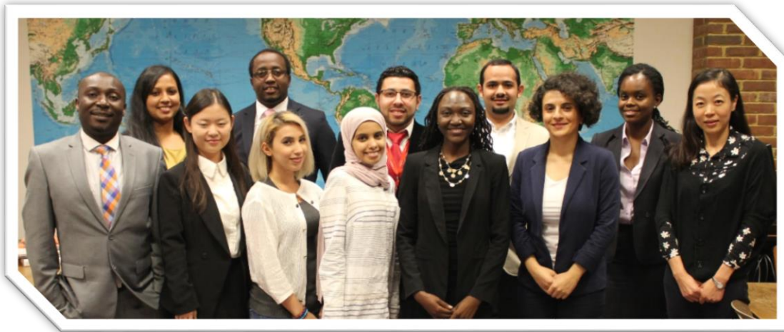
Members of Our LLM Class of 2017