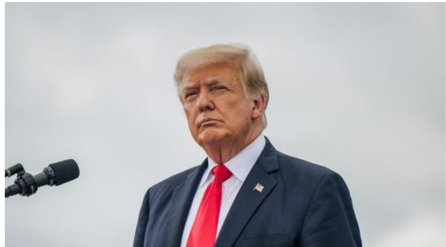
Figure 1: Donald Trump

Donald John Trump was born as the fourth of five children on 14 th June 1946 in New York City. He is the son of the successful real estate developer Frederic Christ Trump and Mary MacLeod. He was elected to be the 45 th