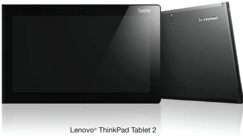
Lenovo® ThinkPad Tablet 2