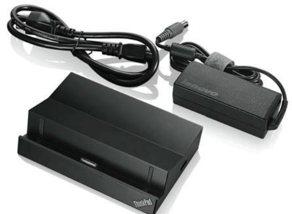
ThinkPad Tablet 2 Dock 0B47109