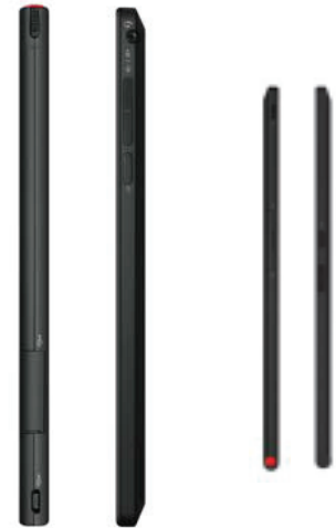
Lenovo ThinkPad Tablet 2