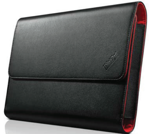
Lenovo ThinkPad Tablet 2 with ThinkPad Tablet 2 Fitted Sleeve 0A33902