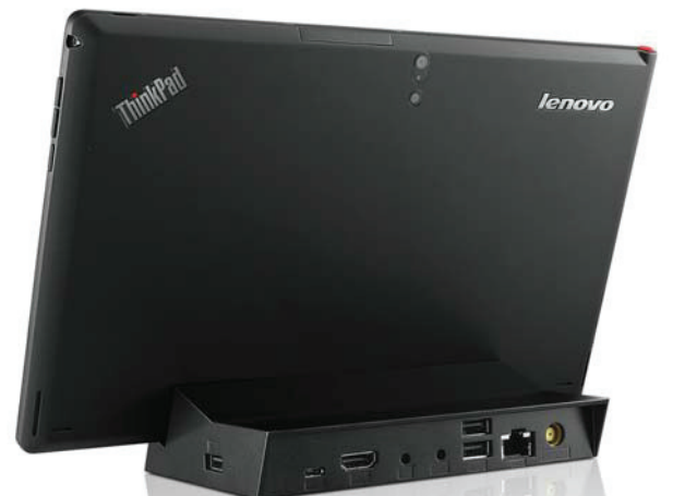
Lenovo ThinkPad Tablet 2 with ThinkPad Tablet 2 Dock 0B47109