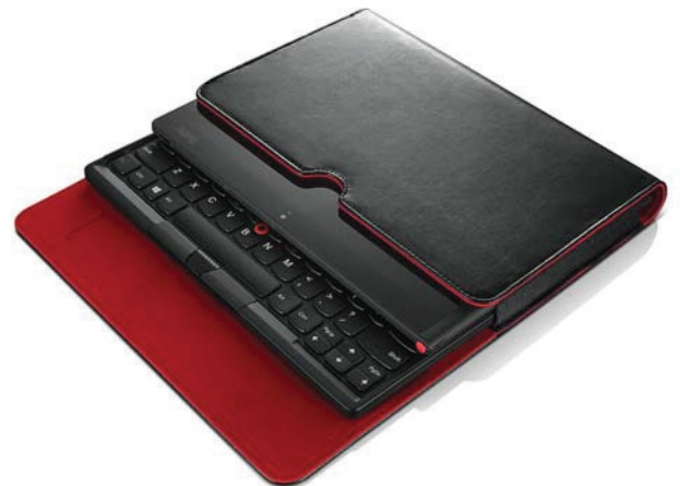
Lenovo ThinkPad Tablet 2 with ThinkPad Tablet 2 Fitted Sleeve 0A33902