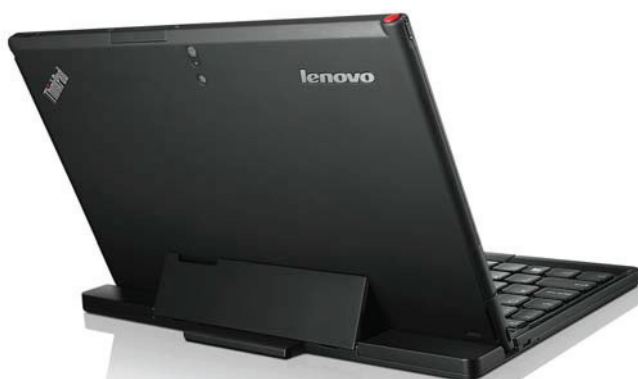
Lenovo ThinkPad Tablet 2 with ThinkPad Tablet 2 Bluetooth Keyboard with Stand 0B47270