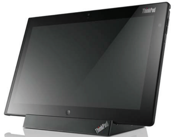
Lenovo ThinkPad Tablet 2 with ThinkPad Tablet 2 Dock 0B47109