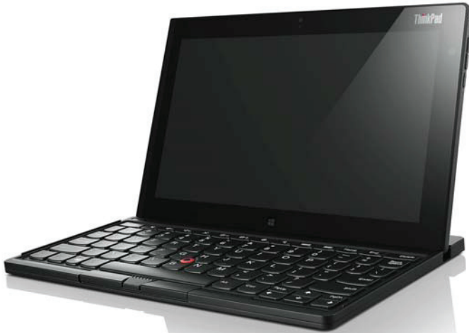
Lenovo® ThinkPad Tablet 2 with ThinkPad Tablet 2 Bluetooth Keyboard with Stand 0B47270