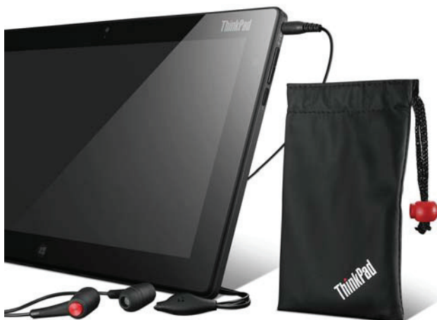
Lenovo ThinkPad Tablet 2 with ThinkPad In-Ear Headphones with microphone 57Y4488