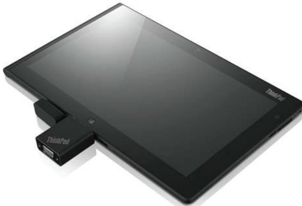
Lenovo ThinkPad Tablet 2 with ThinkPad Tablet 2 VGA Adapter 0B47084