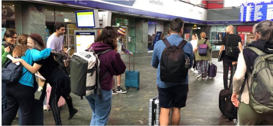
Getting to the 2023 writing retreat