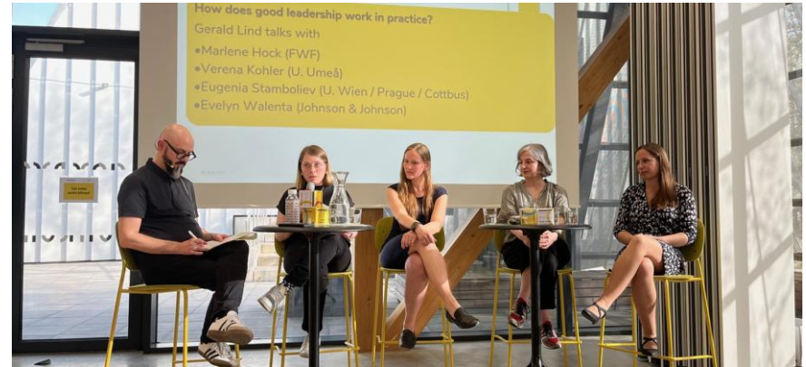
PostDoc Office Annual Event on „Academic Kindness“ 2025

We support 17 internationally oriented research groups conducting research on an overarching topic (RCC consortia) and promote structured doctoral training. We host pizza nights, PhD pub crawls, writing retreats and Fiasco parties. We support & encourage meetings of writing groups, the supervisor network, the MCAA, Mothers in Science and other researcher-led groups.