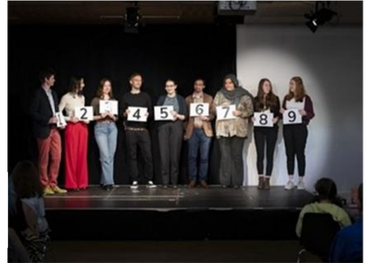
Right: Participants of the Graz 3MT Competition 2025

We award the Seraphine Puchleitner Award for doctoral supervision, which is unique in Austria, and organise the Graz 3-Minute Thesis Competition, in which doctoral researchers explain their doctoral theses to a lay audience in three minutes. In 2024, the University of Graz 3MT winner also won the European Coimbra Group Competition, and in 2025, the University of Graz winner came second in the European CG 3MT final.