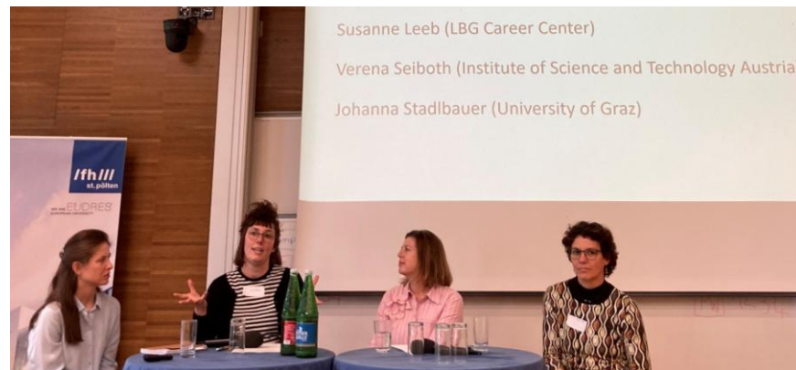
Paneldiskussion des BMFWF an der FH St Pölten, 2025