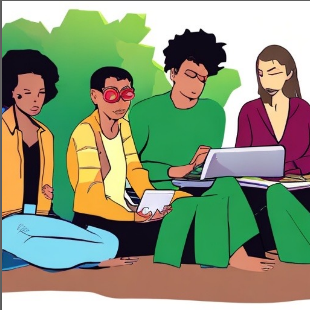
AI generated image