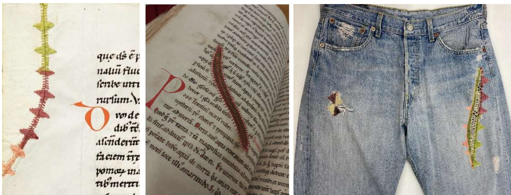
Stitching patterns in liturgical books from the 12 th century Ms 435 & Ms 293