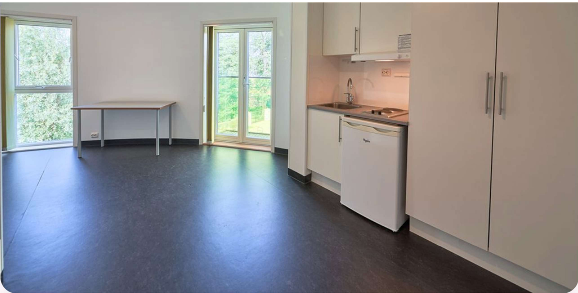
Eksempel: 1-roms leilighet