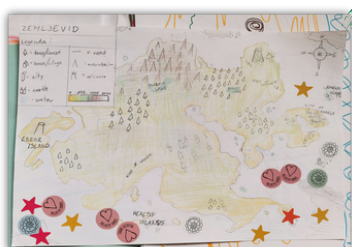
Student design (SLO)

One of the most exciting happenings of the last few months in the me_HeLi-D project has been the realization of the various student ideas from the design workshops (June 2023) by the amazing Slovenian designer Monika Klobčar . After many months of sketching and iterating, the designs were finalized and digitalized. Great care was taken to ensure that they closely followed the students' original ideas, but also resulted in a well-rounded and coherent overall design. Two examples of how the Landscape of a Mind and the buddy character HeLi, the Crow , were realized are shown below.