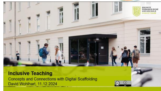
Screenshot of the slides to the presentation "Inclusive teaching: Concepts and connections with Digital

The links to the slides and the review of the event can be found on our Equi-T website: https://equi-t-academy.eu/en/events-2/