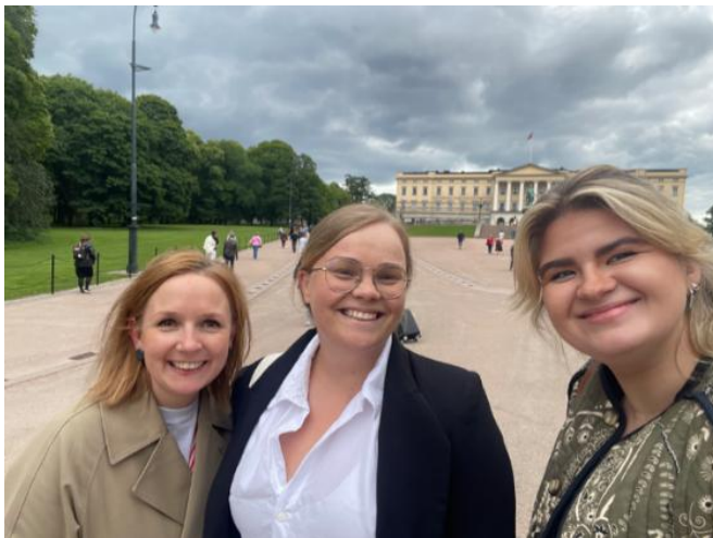
Tallinn University team in lovely Oslo during the Equi-T meeting 2024.

The centre encourages highly links between research and teaching. Our teaching is research-led and research is informed by our teaching. We involve our MA and PhD students in our projects and research activities. Our teaching programs on the MA level are international level programs: Digital Learning Games and Open Society Technologies and local programs Educational Technology and Teacher for Informatics. Also, we are actively collaborating with the Estonian schools to pilot research-based solutions and methodologies and policymakers from HarNo to integrate our research results to policy actions.