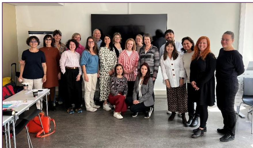
Members of the EQui-T project consortium in Oslo

During the two very productive meeting days, the team also had the opportunity to get to know each other better while having lunch together, dinner in Oslo city centre, or strolling through Oslo and enjoying some sightseeing by feet and by ferry.