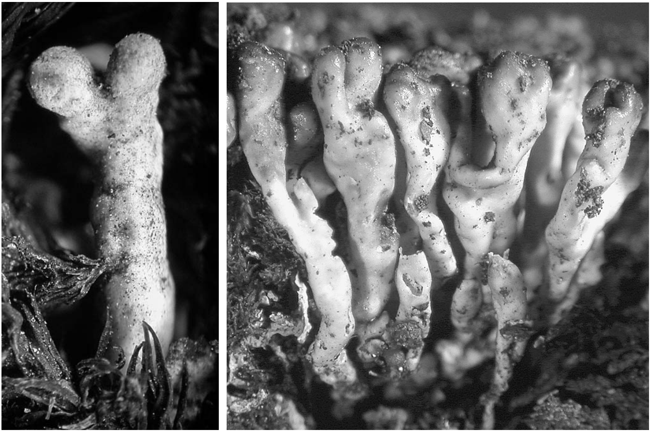
Fig. 3: Fruticose habit in a) Lecanora geophila (Miehe 2414) and b) Toninia bullata (please add collector and numberxx)