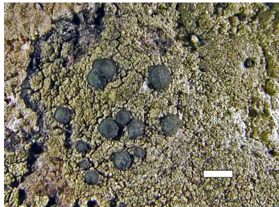
Figure 1. Cratiria jamesiana (holotype in BM). Bar = 2 mm.