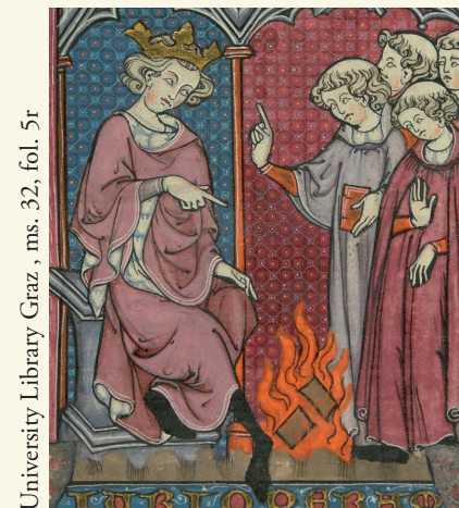
University Library Graz, ms. 32, fol. 5r

June 30 th – July 11 th 2014 GRAZ | AUSTRIA